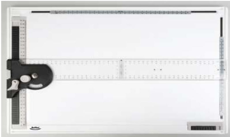
1. A3 Drawing Board with a T-Square

Please see example of pictures from items 1 – 8, below: