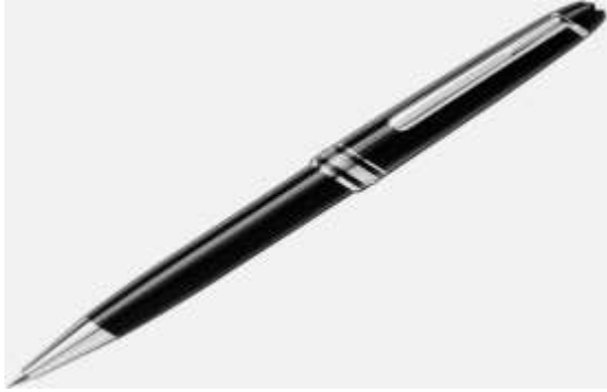
7. 0.5mm Clutch pencil