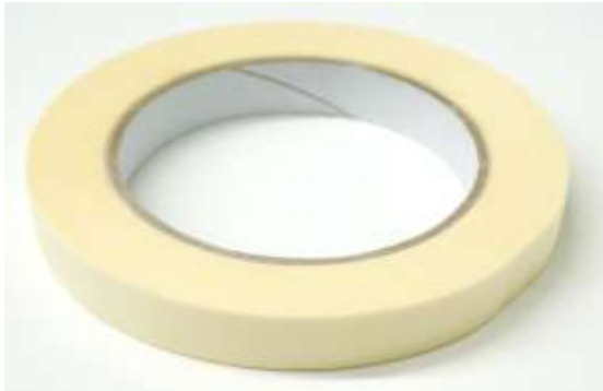
8. Masking tape