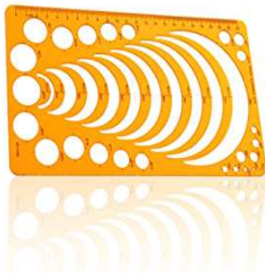
2. Drawing Stencil