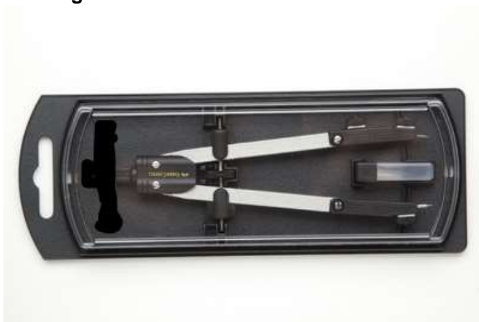
3. Pair of Compasses